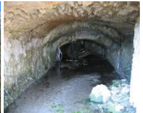
8 - impeller wheel