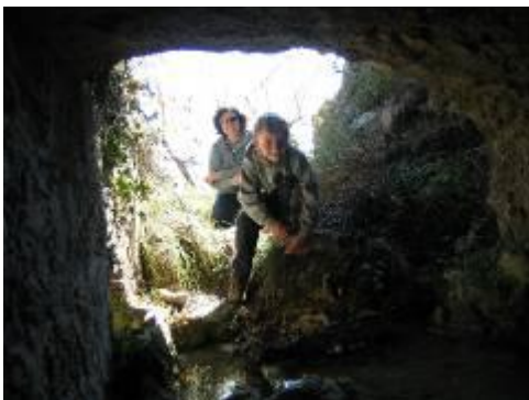
9 - exploring the old mill