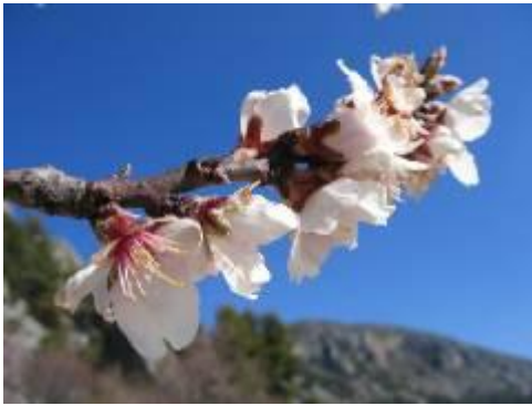
3 - almond blossom