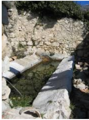
2 - the old wash house - lavadero