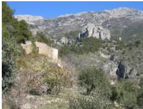
7 - the old mill