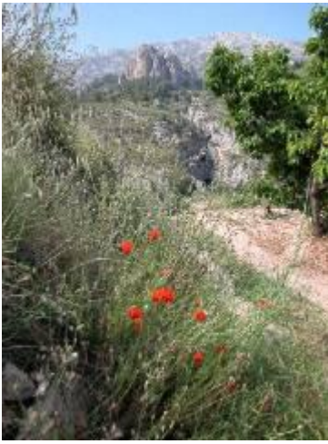
1 - early summer flowers