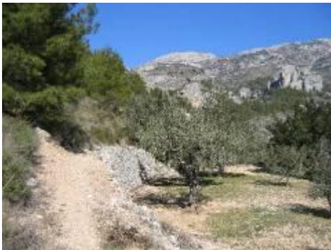
6 - path leading to the old mill