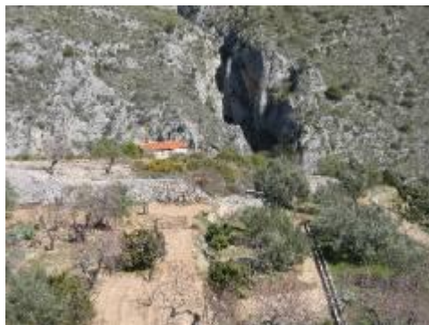
10 - view across terraces to the barranco