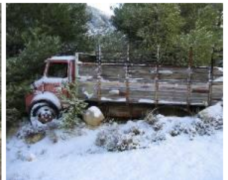
11 - ancient truck in unusual conditions