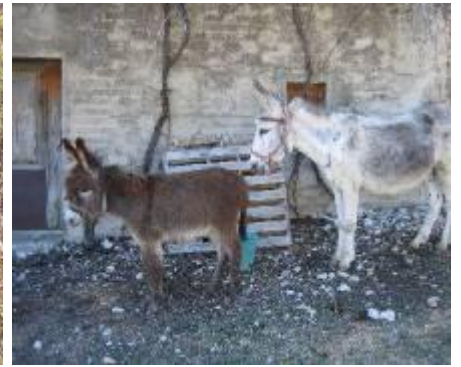
5 - donkeys in abdet