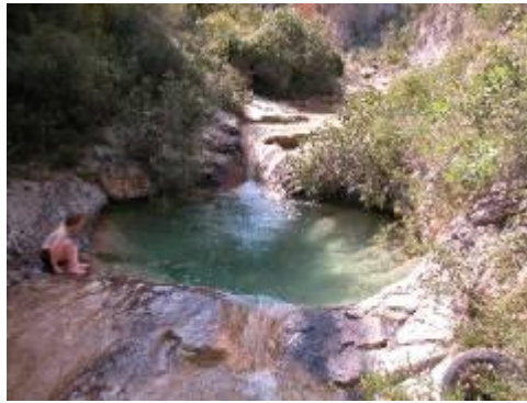
4 - solitude in the Barranco de Meli