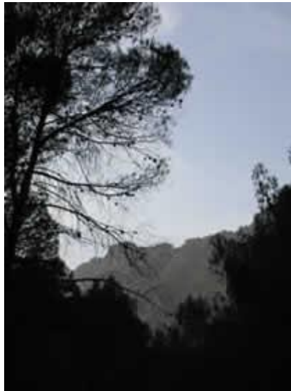
View from the forest