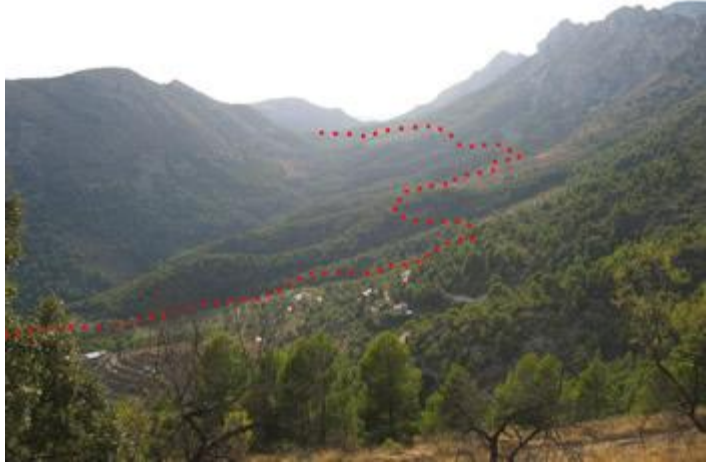
photo of first part of route

The best starting point is at the Forest track 2.5km from Confrides (heading towards Alcoy). The track is identified by the large red Serella - Aitena forestry sign. If you reach the shop or the top of the pass you have gone too far. Park at the start of the track and follow this up a short climb to the walks high point at a three way split in the track. We follow the middle track (straight on). Soon the steep South facing wooden hillside (La Solana) comes into view, almost it's entire length is guarded by spectacular cliffs and pinnacles. You will also notice an amazing arch which aligns with a pinnacle as you start the initial gradual descent.