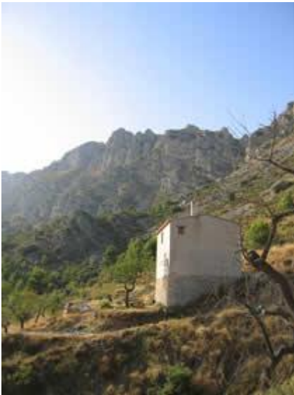
The artists house

If you left your car at the start, don't forget to go and collect it!