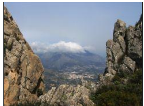
view from the ridge