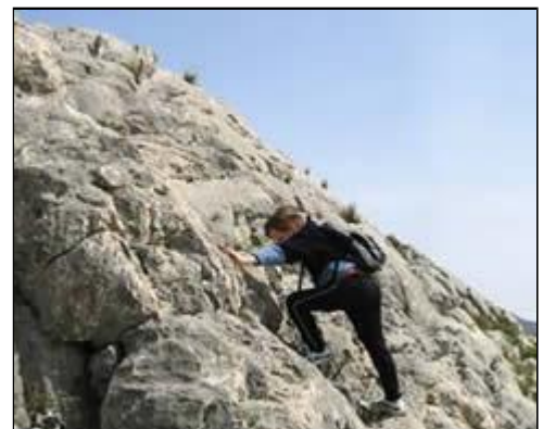
scramble to the summit