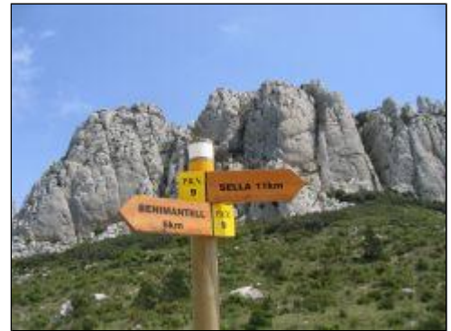
signs at the pass