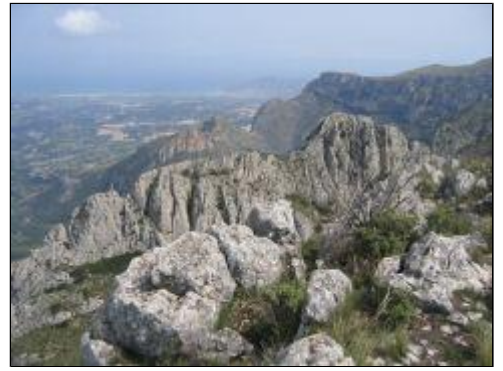
View from Summit